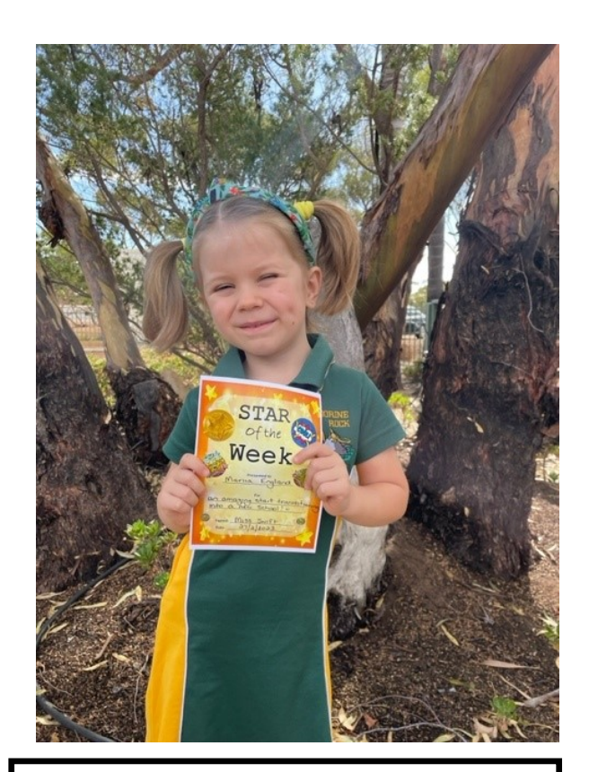
Week 4 Junior Room Star of The Week