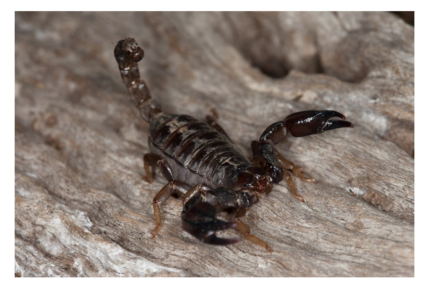
Have a nasty bite and live mostly in semi-arid environments

They live in the tropical north of Australia in wooded or Savannah type environments. When they run they move so fast that the front legs lift and they are then running on the rear two legs. They spend most of their time in trees looking for possible sources of food.