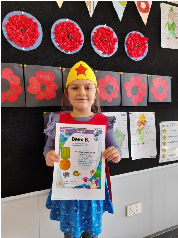
Reading Eggs Award Demi