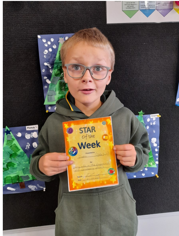
Star of the Week Term 4 Week 8