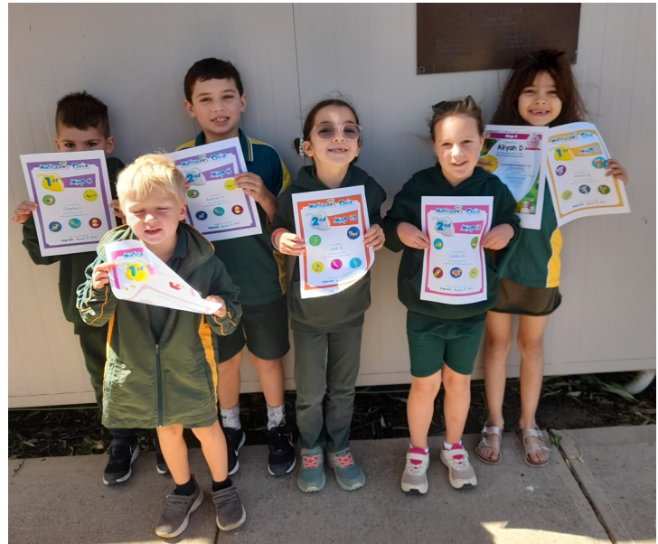
For achieving great results in Maths Seeds and Reading Eggs