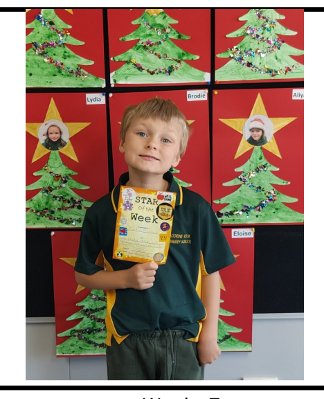
Week 7 Senior Room Star of the Week