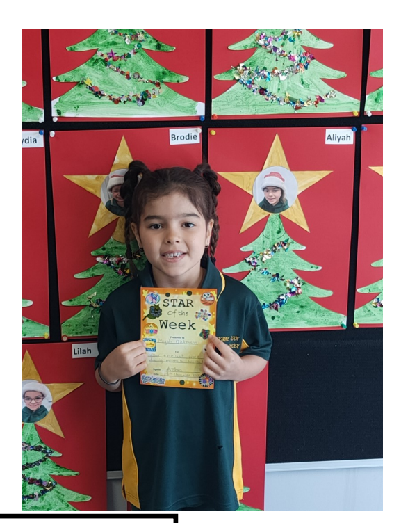
Week 7 Junior Room Stars of The Week