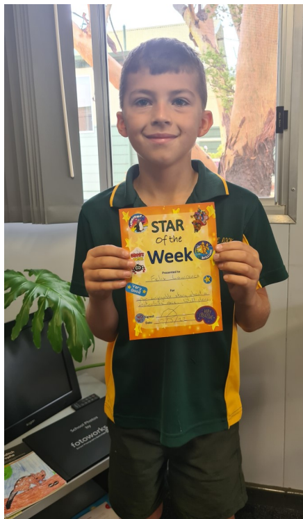
Star of Week Senior Room Term 1 Week 8