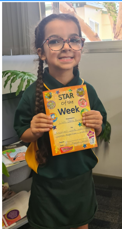
Star of Week Junior Room Term 1 Week 8