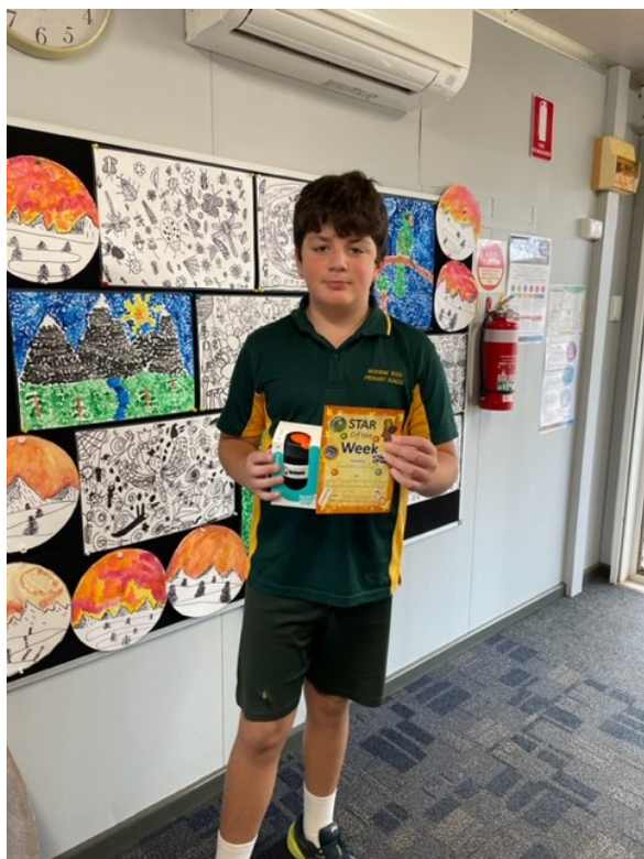
Star of Week Senior Room Term 1 Week 9