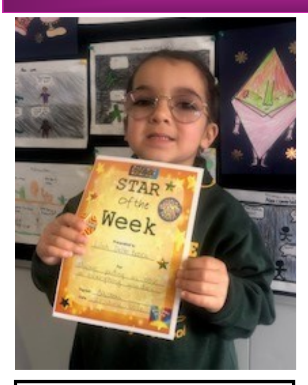
Junior Room Star of the Week Term 2 Week 10