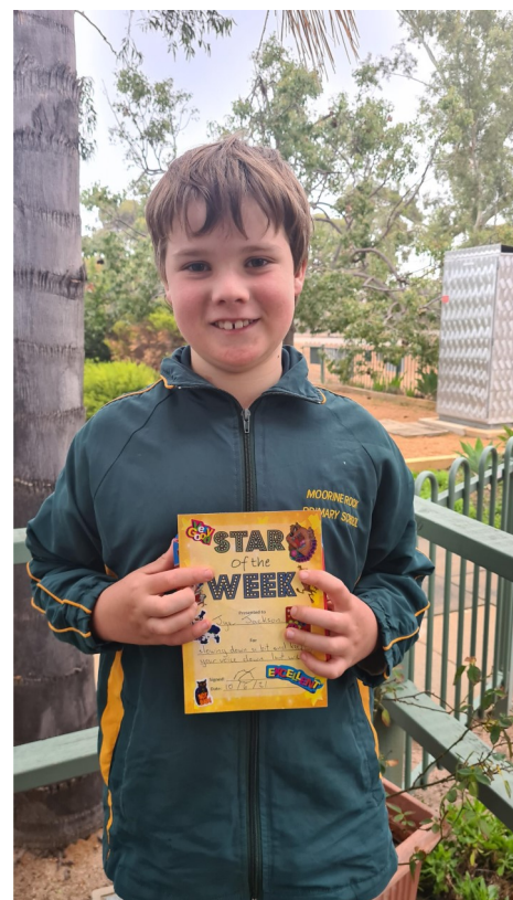
Senior Room Stars of the Week Term 2 Week 9