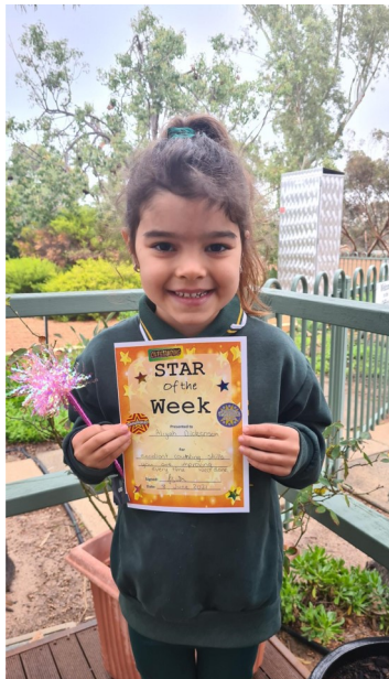
Junior Room Star of the Week Term 2 Week 8