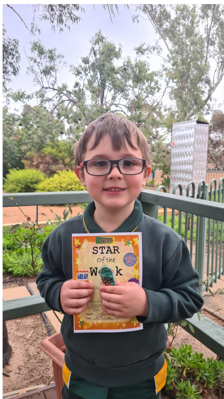
Junior Room Star of the Week Term 2 Week 9