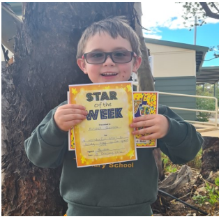
Junior Star of the Week Term 1 Week 2