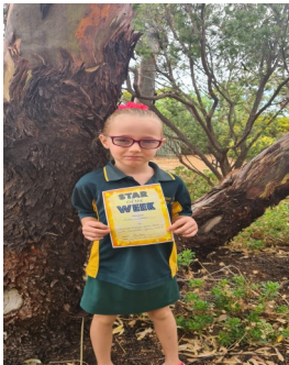
Junior Star of the Week Term 1 Week 3