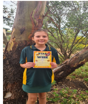
Senior Star of the Week Term 1 Week 3