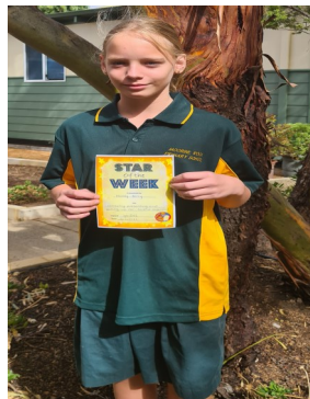
Art Room Star of the Week Term 1 Week 2-3