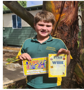
Senior Star of the Week Term 1 Week 2