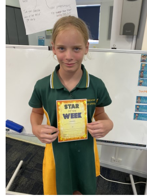
Senior Star of the Week Term 4 Week 8