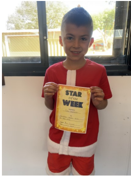
Junior Star of the Week Term 4 Week 8