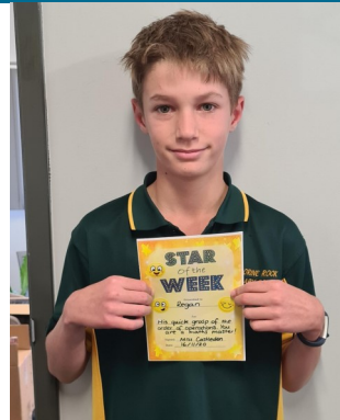
Senior Star of the Week Term 4 Week 6