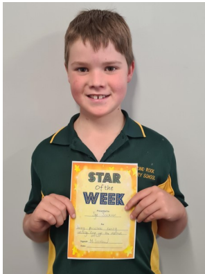
Junior Star of the Week Term 4 Week 6