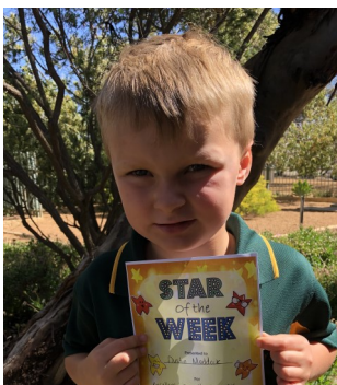
Junior Star of the Week Term 4 Week 7