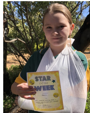
Senior Star of the Week Term 4 Week 7