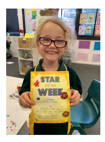
Junior Star of the Week Term 4 Week 4