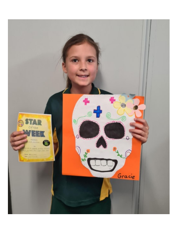
Senior Star of the Week Term 4 Week 5