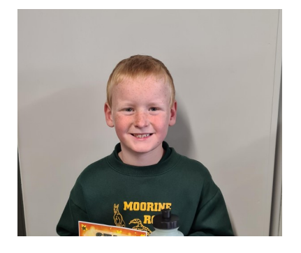
Junior Star of the Week Term 4 Week 5