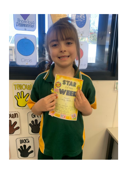
Junior Star of the Week Term 4 Week 3