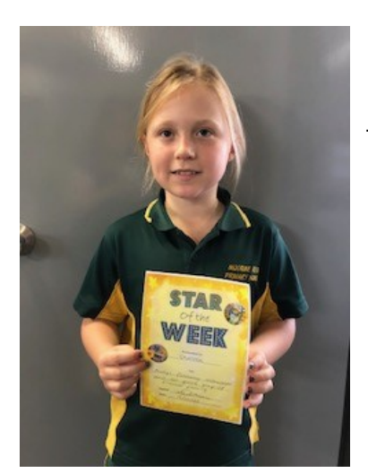
Senior Star of the Week Term 4 Week 3