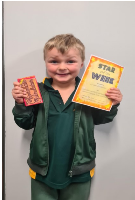
Senior Star of the Week