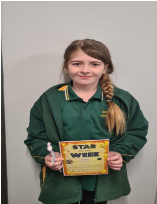
Junior Star of the Week