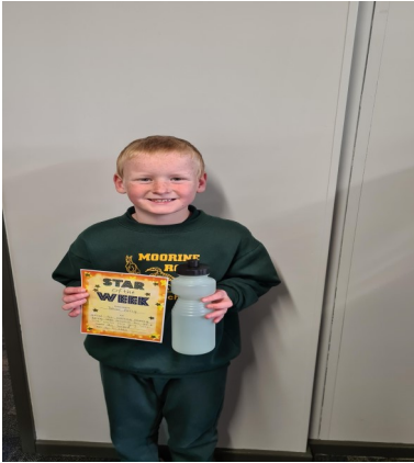
Junior Star of the Week Term 3 Week 4