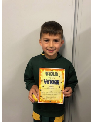
Junior Star of the Week Term 3 Week 5