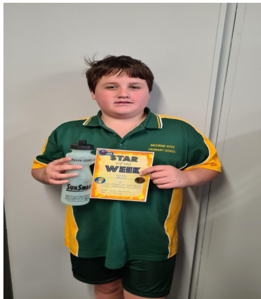
Senior Star of the Week Term 3 Week 4