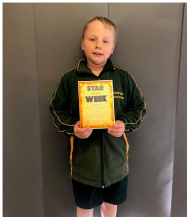
Senior Star of the Week Term 3 Week 5